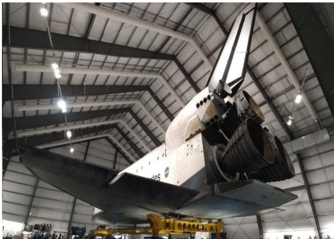
Shuttle Endeavour rests after a distinguished career