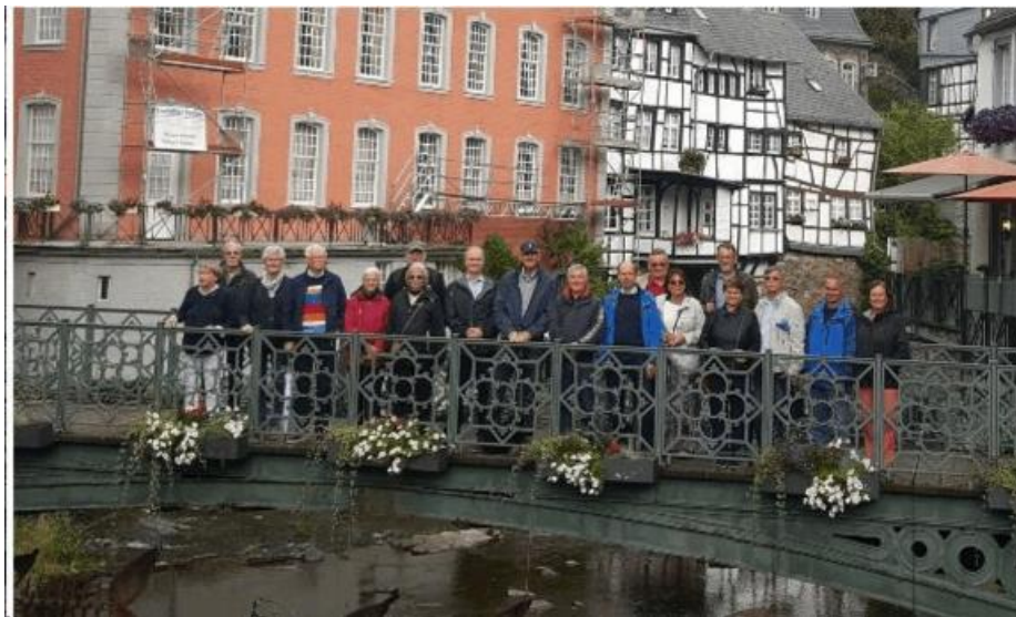
International GEOINTers gather in Euskirchen, Germany for the 2 nd Geo Reunion